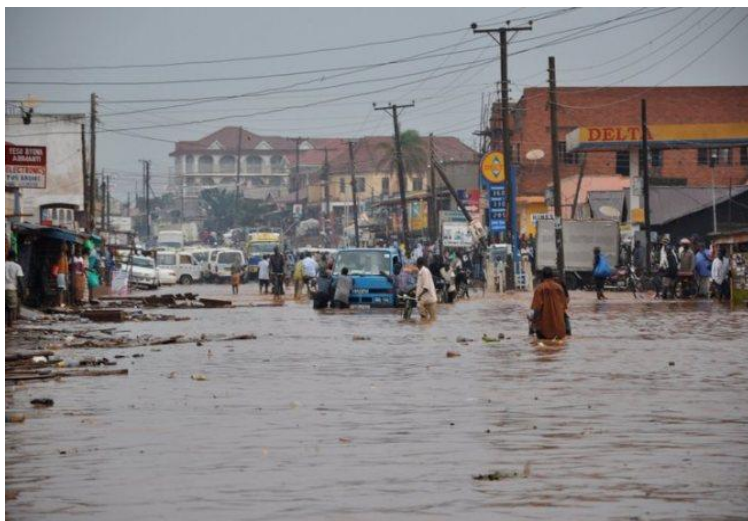
Floods submerge road in Bwaise, 2011. Awamu,