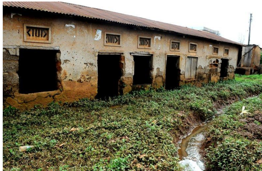
bandoned houses in Bwaise – due to flooding, 2010. Echwalu