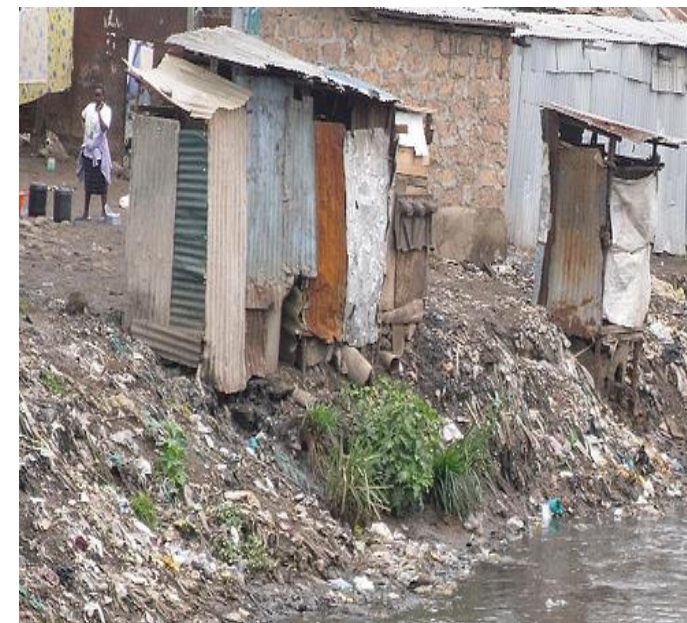
Such Toilet facilities are common in Kampala Slums and have a practice of disposing off sewerage into drainage channel at the onset of the rainfall down pour!