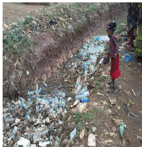
Poor Waste management and disposal in Kampala City.