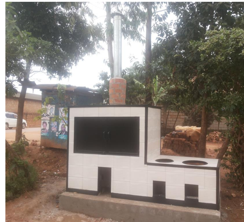
Improved institutional stoves – for baking – as part of technology access support by provided to a Women's Group in Kampala, Makidye dision – by EA in collaboration with Water Aid Uganda.