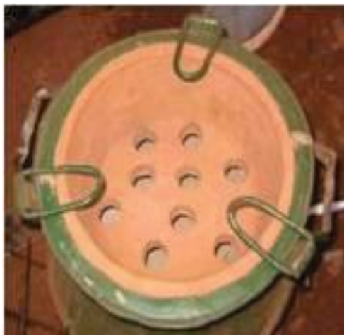
Improved energy cooking stoves.