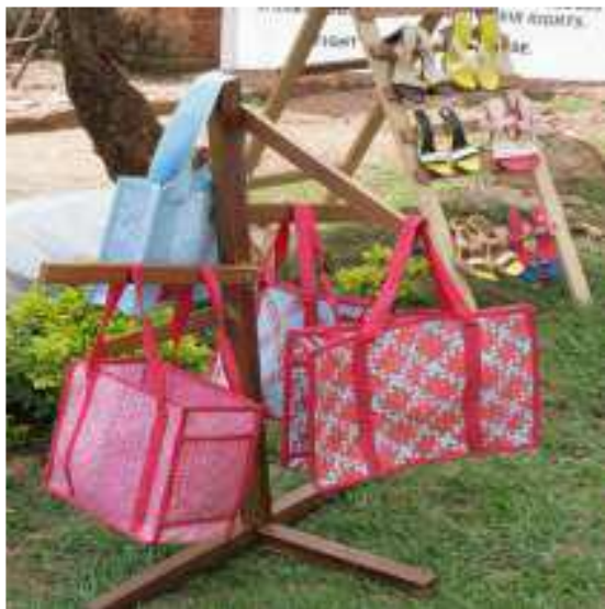
Assorted products made from recycled straws by Kinawattaka Women's Initiative in Nakawa Division.